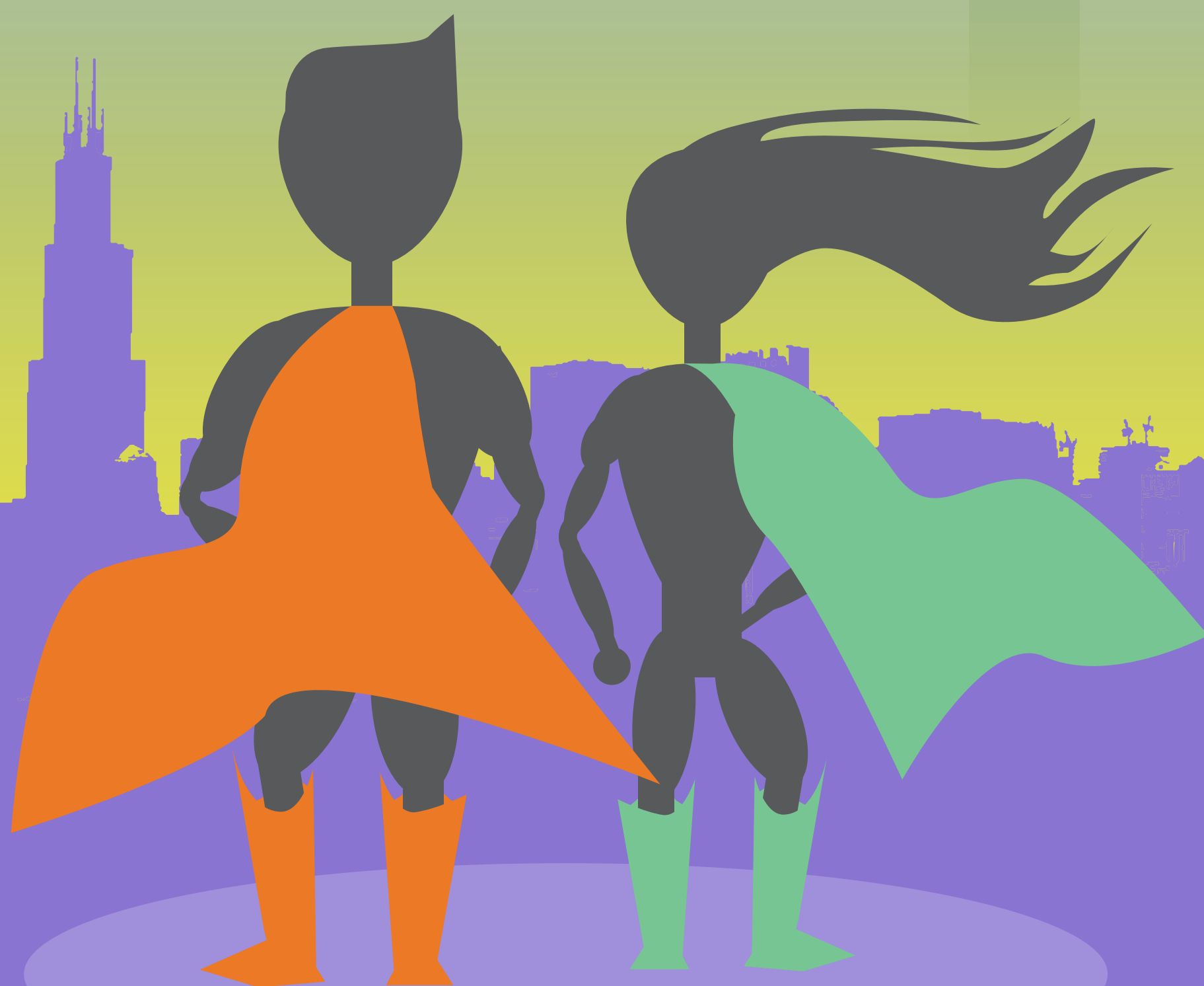
Fig. B: Parentes Superiores